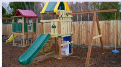
Outdoor play area.