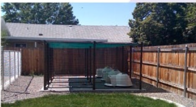
DVS is one of the first shelters in the nation to house pets.