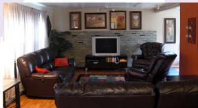
Home for the Holidays? Last Christmas, 7 families with 14 children stayed at the shelter.